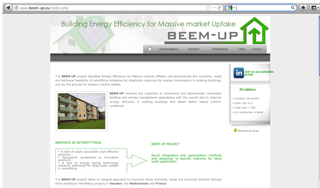
Figure 1: BEEMUP main website page

On the publications tab (see figure 2), there is a link to the document with the first presentation of the detail plans of the pilot sites. Corresponding to the deliverable D1.7. The permission to publish the information has been required and confirmed by the three building owners (AHM, Woonbron and ICF) but due to the tender the releasing will be the 20 th of September as it was stated earlier.